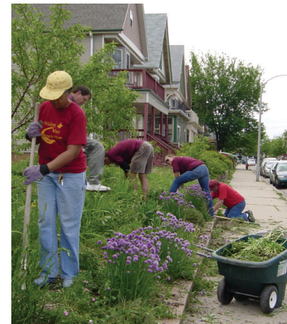
Rotary Club Volunteers help out in Walnut Way gardens.

Finally, temperatures are starting to climb and our gardens are starting to sprout. Days are longer and the air is filled with sweet scents and the sounds of children. Summer is a very busy time of year for us here in Walnut Way. Our gardens require full attention and many seasonal programs are up and running. Gardens to Market teens have been selected and will begin their work soon, planting gardens around the neighborhood. Our 4H Club continues to meet on Fridays at 4:30pm. Here are a few ways your family can keep busy this summer-