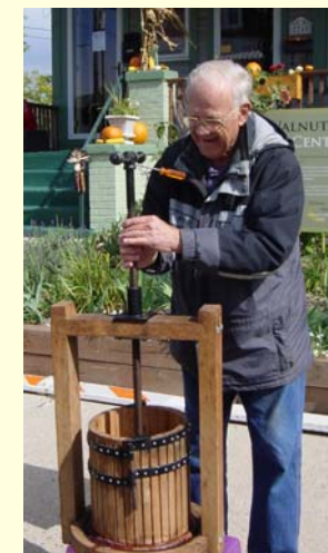
Pressing Concord Grapes donated by friendly farmers

and attendance. While similar to many famous street festivals in Milwaukee, the diversity attracted by Harvest Day is second to none. Folks from all walks of life join to celebrate a community who refused to accept the status quo. Events which engage residents, supporters, and agencies serving the Milwaukee Community are key to weaving our social cloth. Harvest Day is a testament to the rebirth of this neighborhood and proof that collective action creates results. We will celebrate the 10th anniversary of Harvest Day and the 100th anniversary of the Walnut Way Center in October 2010. We hope you can join us for this momentous occasion.